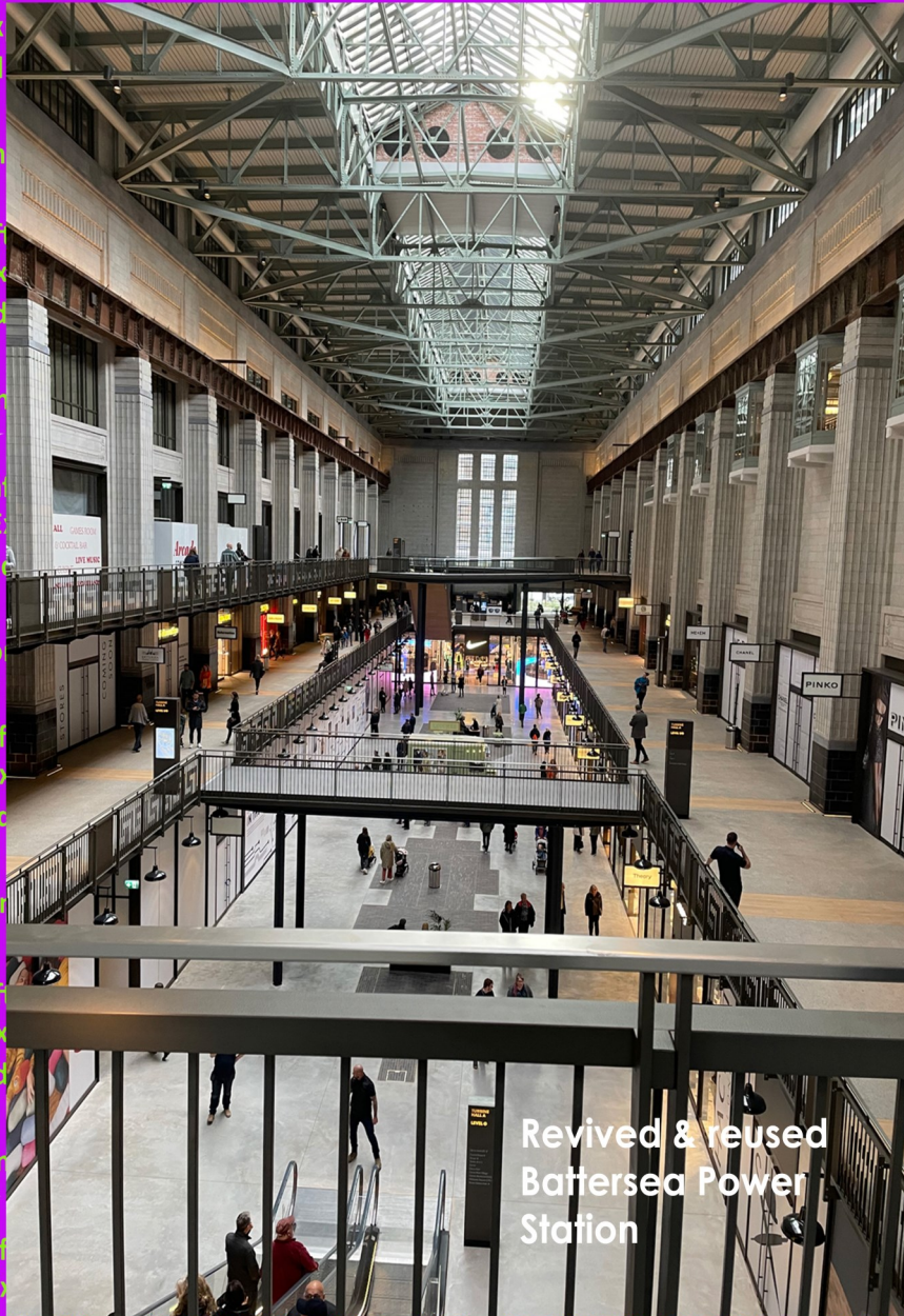
Revived & reused Battersea Power Station