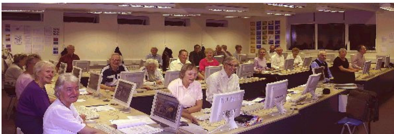
Our picture, taken on the final evening, shows the stalwarts who stayed the course.