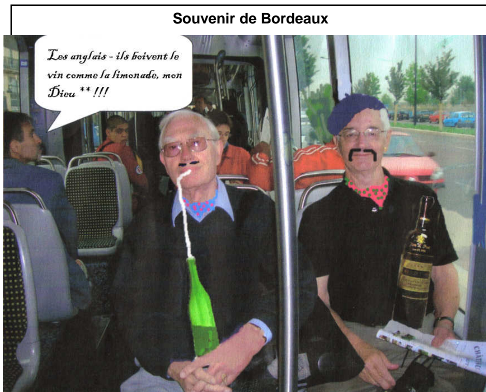
Two 'Winos 2' members trying to blend into their surroundings!

On our final full day we took a local bus to Blaye, passing through the vineyards of Bourg and Blaye. There is a well preserved Citadel by Vauban, where we had a noisy, alcoholic lunch with friends who live there, looking across the Gironde towards the Médoc. We paid a visit to the Maison de Vin and then went to Cars, a nearby village, to watch the vendage in full swing. The whole process is now fully mechanised with no pickers involved, just a large amount of noise and vehicular activity. After tea and sandwiches at the pool-side with our friends, we caught the bus back to Bordeaux, where it seemed to be time to prepare for another round of eating and drinking.