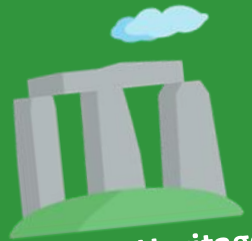
History & Heritage