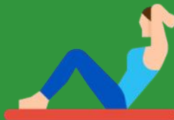
Sport & Fitness