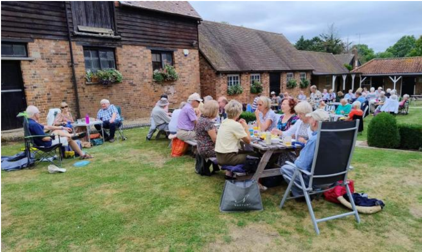
U3a members relax in the Courtyard Garden of the Grade II listed Tithe Barn