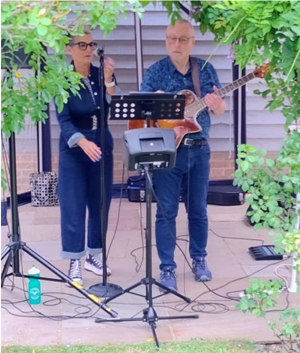
Summer Event Entertainers—Utterley Unique

Thank you to all our members who supported the event.