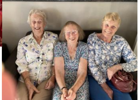
And a good time was had by everyone.....