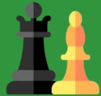
Games & Pastimes