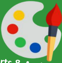
Arts & Antiques