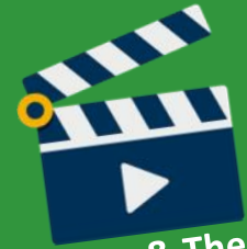
Cinema & Theatre